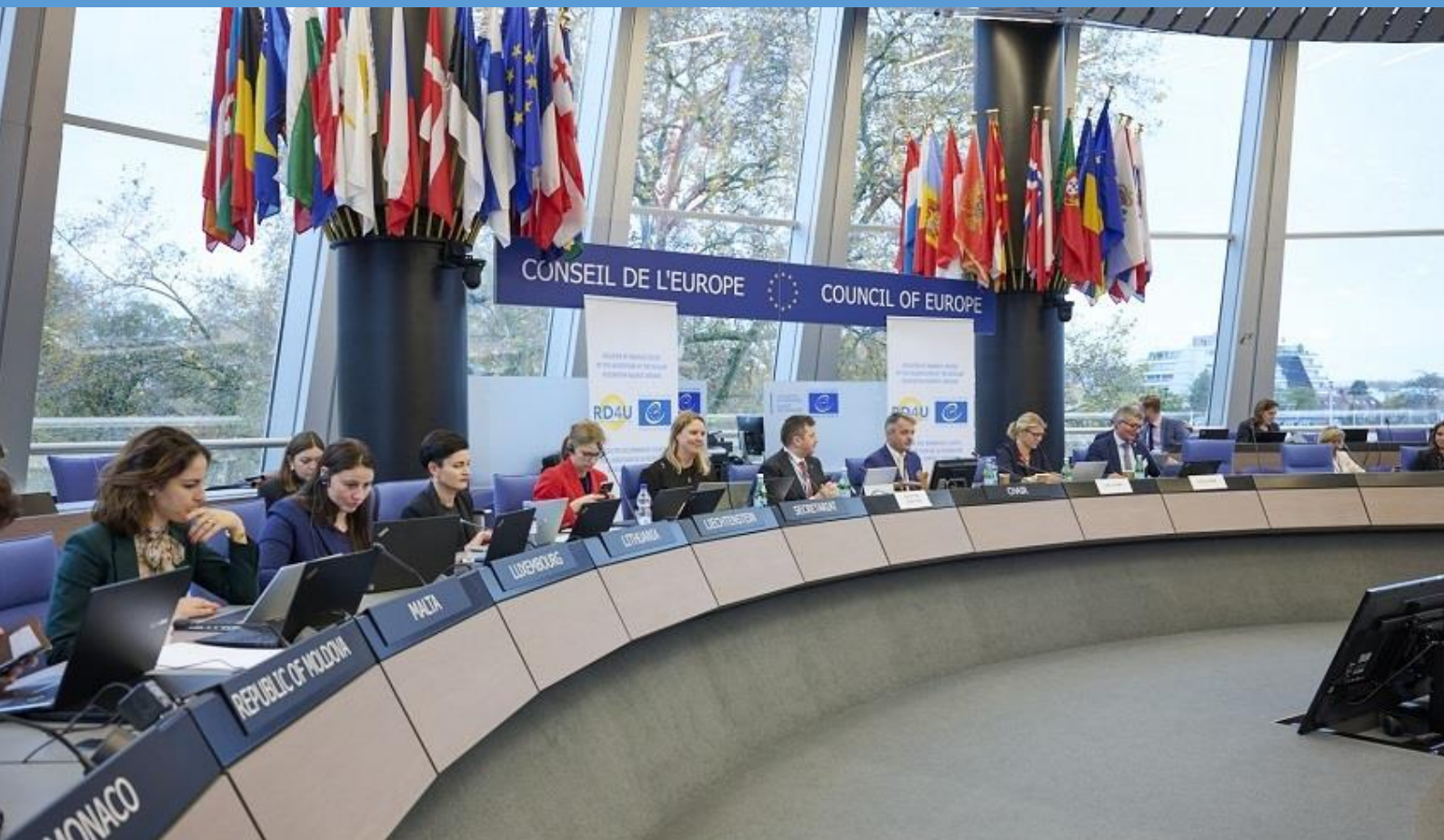
The Conference of Participants meeting for the third time and electing seven members of the Board of the Register of Damage, Strasbourg, 16 November 2023