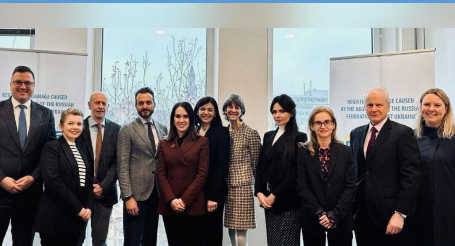
The Board of the Register of Damage at its inaugural meeting, The Hague, 11-15 December 2023